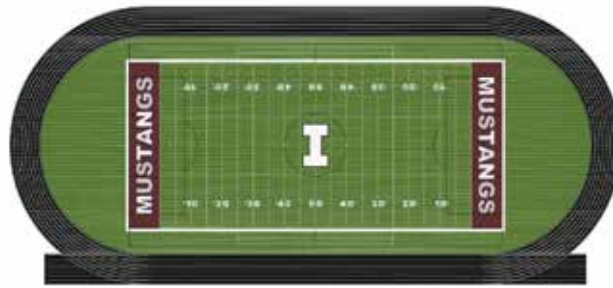
Turf at Leinbaugh Field