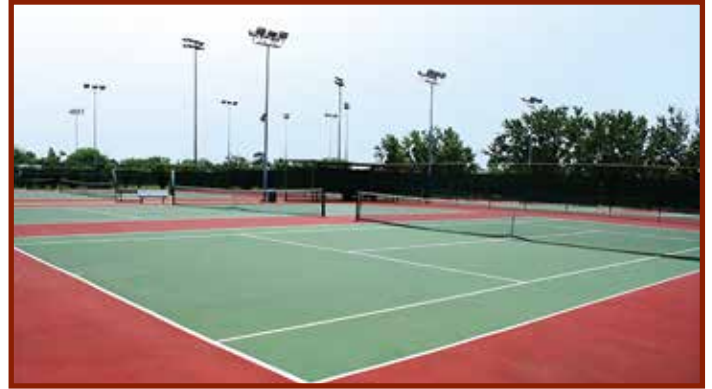
Six Tennis Courts